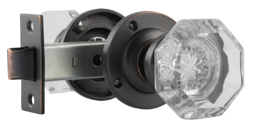
1996 tube latch with a 0711 Glass Knob in Antique Copper

These can be 5 Lever High Security Locks, to be used on external doors, or 3 Lever Low Security Locks to be used on internal doors. The difference between 5 Lever and 3 Lever Locks is the number of different key combinations available. 5 Lever Locks also have an 'anti pick curtain', which makes it harder to access the working components in the lock once fitted inside your door, in addition to reinforced steel pins through the locking bolt. They are suitable with any of our door furniture labelled 'Lock' in the description. These locks are supplied with a 'skeleton' key<sup>9</sup>. 5 Lever Locks have the same level of Security as Euro Locks. The main difference is that the 3 and 5 Lever Locks are more 'traditional' for period homes. These locks can be supplied keyed alike.