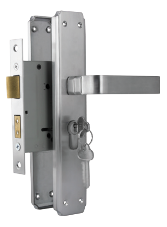
2177 Euro Lock, 2077 Euro Cylinder and 0661E 'Rotterdam' Door Lever in Satin Chrome