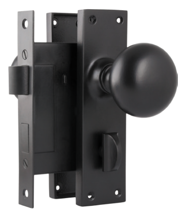
2263 Privacy Lock with a 0959P 'Victorian' Knob in Matt Black