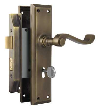
2163 5-Lever Rebated Lock with a 0787 'Milton' Door Lever in Antique Brass

Further fitting instructions, templates, care & maintenance information and instructional videos can be found at our websites: tradco.com.au tradco.co.nz