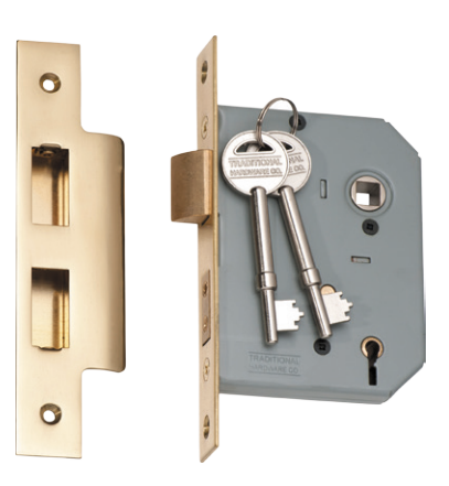
5-Lever High Security Lock in Polished Brass with 'skeleton' keys